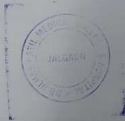
Dean Dr. Ulhas Patil Medical College & Hospital, Jalgaon Kh.